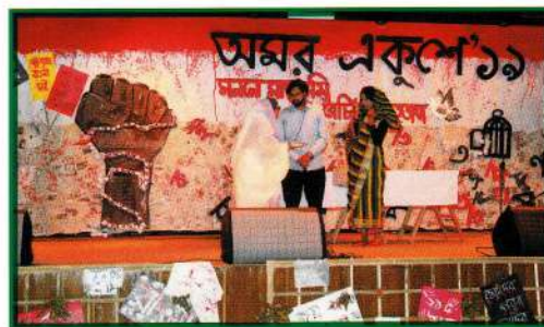
Staging drama on the purpose of celebrating International Mother Language Day