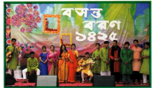
Students performing Boron to mark Boshonto Boron