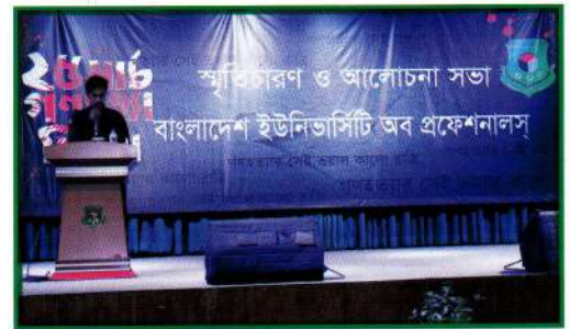
BUP commemorating the Genocide Day