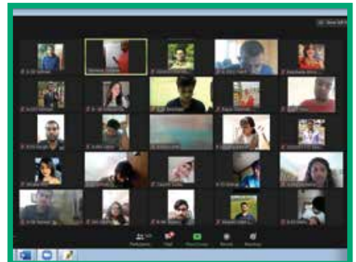
Glimpse of Conducting Online Class amid Pandemic Situation since the Commencement of Lockdown in Bangladesh