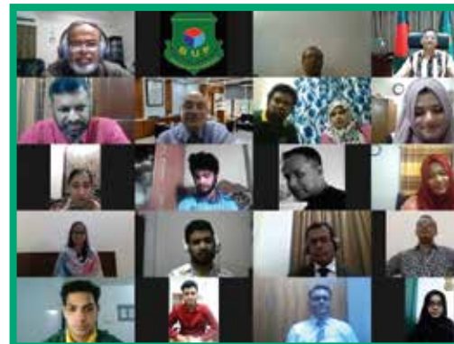
Respected VC Sharing Greetings with BUP Officers, Faculty Members and Students during 12 th BUP Day