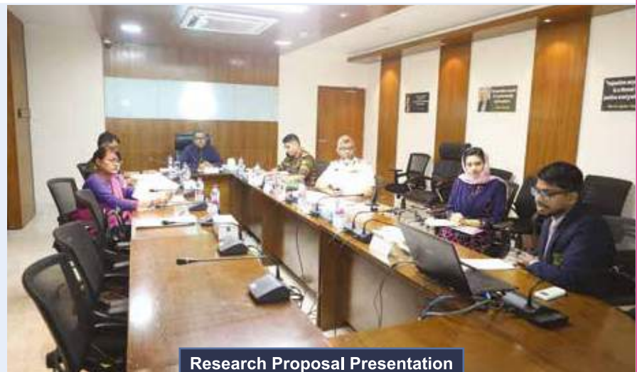
Research Proposal Presentation

The Centre for Higher Studies and Research (CHSR) conducts various higher education- related activities throughout the year. In the last three months, 2 MPhil researchers and 4 Ph.D. researchers have been conferred their degrees. Moreover, 9 MPhil researchers and 21 Ph.D. researchers presented their seminar papers before veteran national and international panel members. The esteemed panel members put their valuable comments and observations in the seminar. Moreover, CHSR also conducted Research Proposal Presentation sessions from several faculty members and officers to select research topics for the FY 2022-2023.