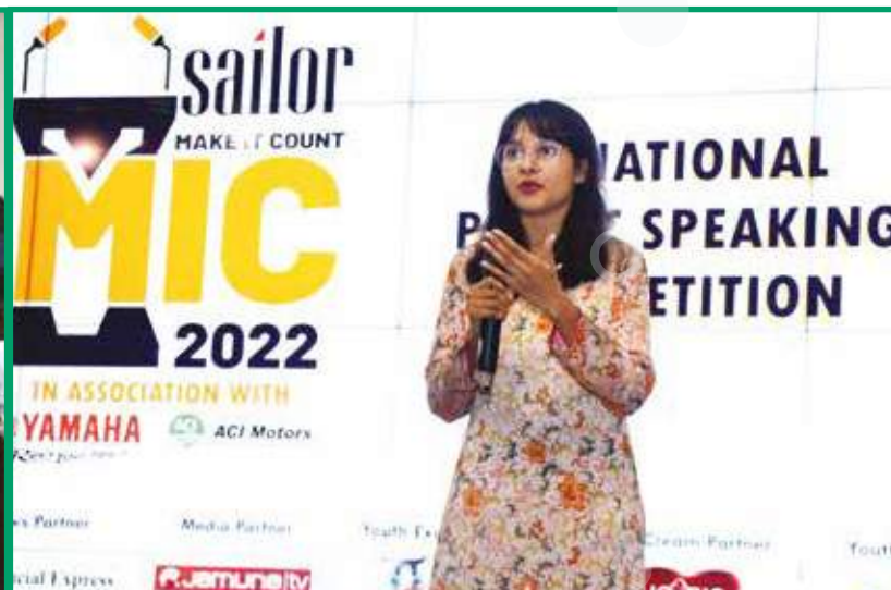
National Public Speaking Competition