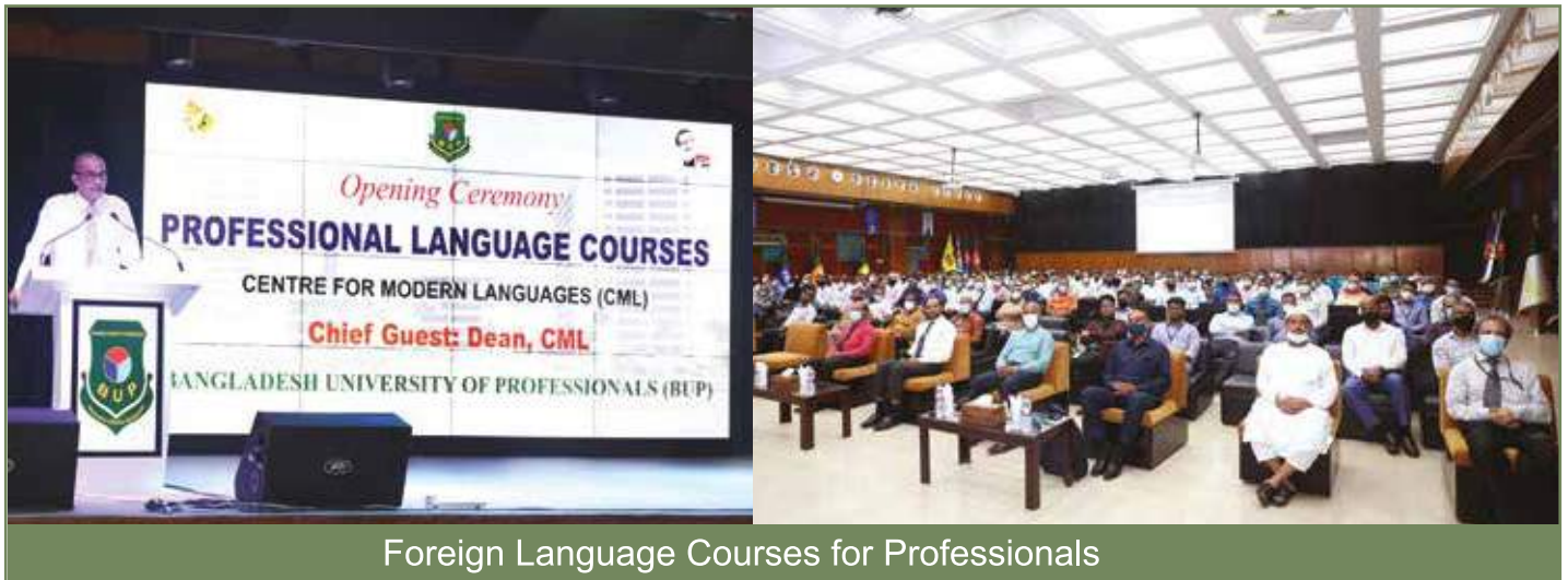
Foreign Language Courses for Professionals

Presently, Centre for Modern Language (CML) of BUP has conducted 03 types of Language Courses for the Professionals (Elementary Course of 04 Months, Level-1 Course of 06 Months and Diploma Courses of 01 Year). In this current Jul-Dec 2022 semester, CML is conducting 08 foreign language courses: 06 Elementary Language Courses {Arabic (2x Sections), French, Chinese, English, German and Turkish}, 03 Level-1 Language Courses (Arabic, French and Chinese) and 02 Diploma Courses on Arabic and French. The opening Ceremony of Language Courses, conducted by the CML for 2022 (B) Batch was held at Bijoy Auditorium on 20 July 2022. The Dean of CML, Brigadier General K M Ferdousul Shahab, BGBM, PBGMS was present as the Chief Guest. Officers of BUP, adjunct faculty members and all participants of the Language Courses were present in the ceremony.