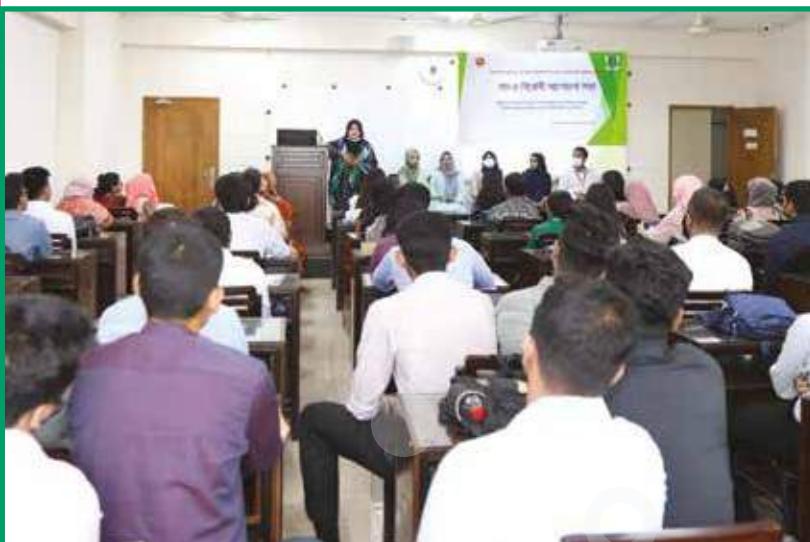
Workshop on Anti Drug