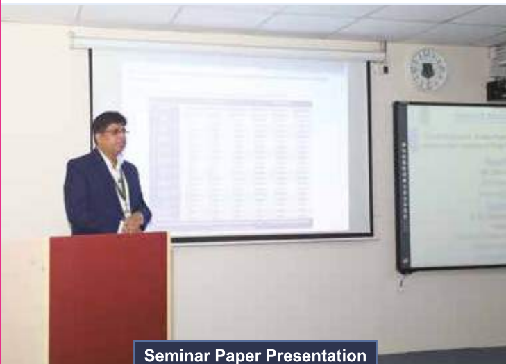
Seminar Paper Presentation