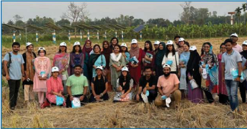
Students of Batch MSS-2023, Department of Development Studies of BUP visited Rural Development Academy, Bogura, as part of the academic course 'Bangladesh Studies' on 10 May 2023.