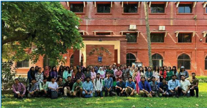
Students of Batch BES-2022, Department of Environmental Science of BUP visited Shaheed Md. Abdul Muktadir Museum Department of Geology, University of Dhaka on 12 May 2023.