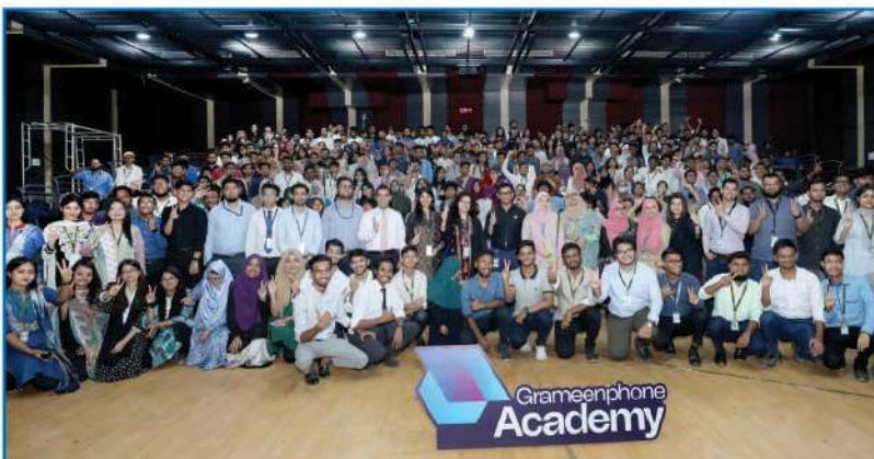
Students of Batch 2020, 2021, and 2022, Department of BSc in Information and Communication Engineering of BUP visited Grameen Phone Academy, Dhaka, on 14 May 2023.