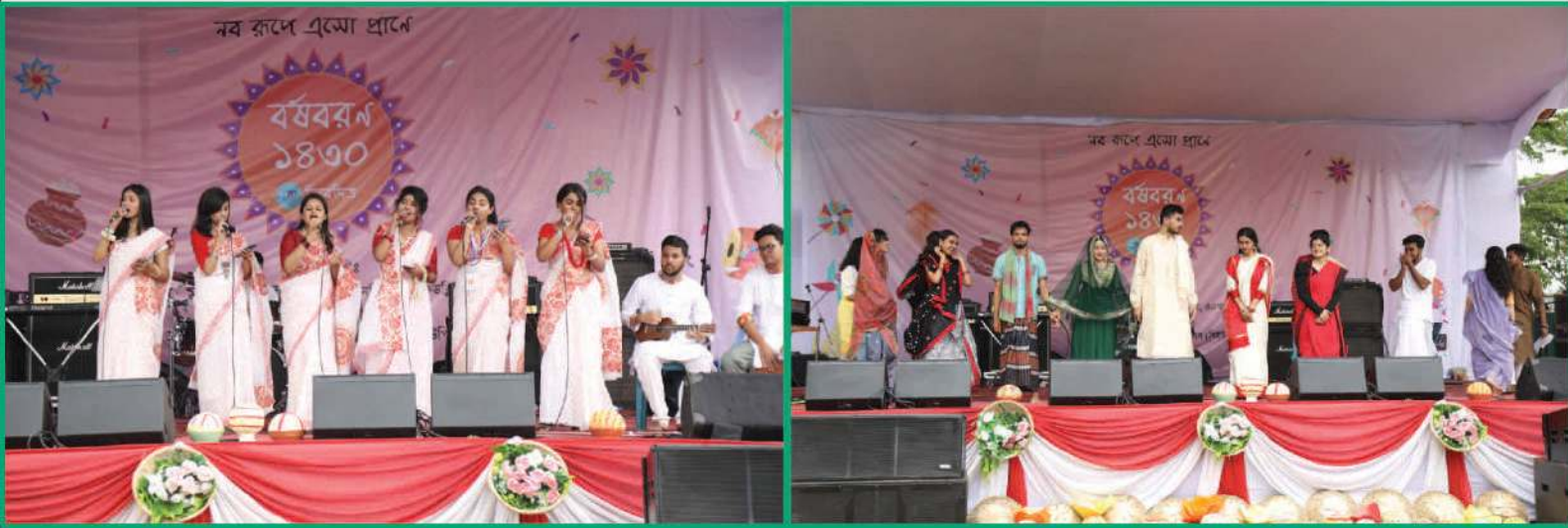
Glimpses from Borshoboron 1430