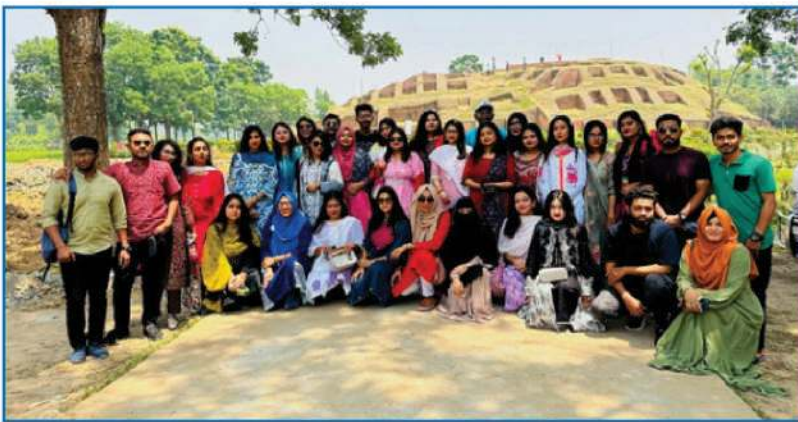
Students of Batch MSS-2023, Department of Development Studies of BUP visited Mahasthangarh as a part of visiting Rural Development Academy, Bogura on 11 May 2023.